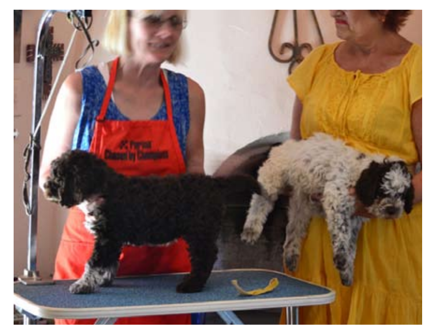
Above: Evaluation Right: Socializing

At 7.5 to 8.5 weeks of age, we evaluate the litter to choose which puppies have the potential for future breeding. Each aspect of the Breed Standard is compared to each puppy. This also helps in deciding which puppy is best suited for which family.