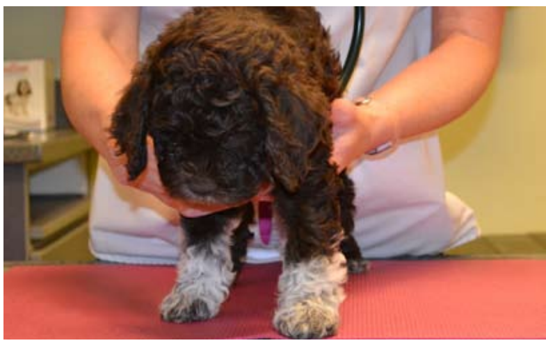
L: first bath, R: vet check

Puppies get a check up at the vet to make sure they are healthy and ready to go. We all have fun when we turn all the puppies loose in the examining room. Mom was still willing to let the puppies nurse at 7 weeks.